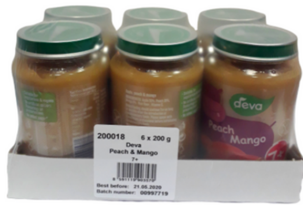
Tray with shrink foil 2x3 125 g or 2x3 200 g