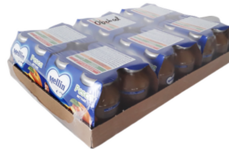
Tray with shrink foil 4x6 125 ml