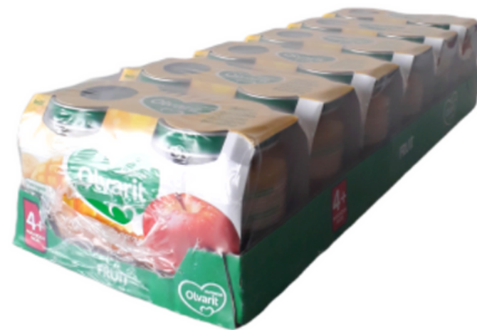
Tray with shrink foil 2x6 125 g or 2x6 200 g