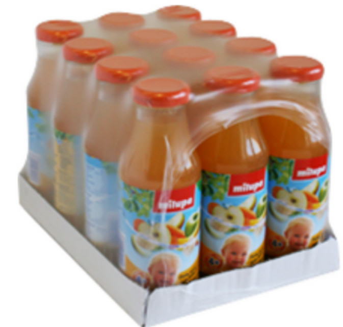
Tray with shrink foil 3x4 175 ml or 3x4 300 ml